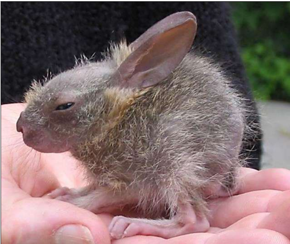
Figure 1: American white-tailed cottontail newborn with a form of congenital hairlessness. Photo:

later in France. Depending on the country, these rabbits had a decreased fur density and present variations in hair growth. This led to the conclusion that there are different