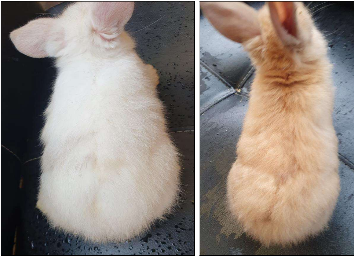
Figure 8: Same rabbits as in Figure 7, at 4 weeks and 6 days of age.

They do, however, tolerate heat better than rabbits with normal fur. These rabbits also need to be protected from the sun's ultraviolet rays and sunburns due to the increased risk of developing skin tumors such as melanoma.