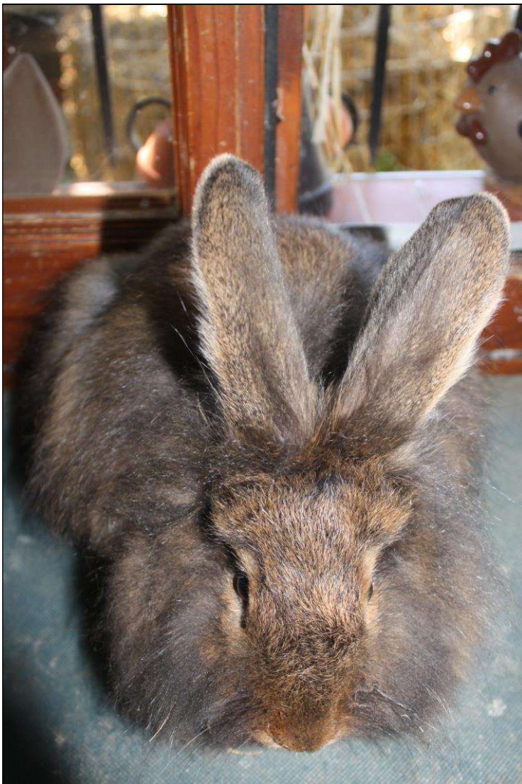
Figure 6: Same rabbit as in Figure 5. The long hairs have started to grow on the head and flanks after several months.

There is no treatment for rabbits with congenital hairlessness or hypotrichosis. In order not to spread this mutation among the offspring, these rabbits should be removed from breeding lines. They can, however, become perfect pet rabbits. Depending on the severity of the hairlessness, it is best to keep these rabbits indoors, in a protected and clean environment, and at comfortable temperatures. Indeed, without fur, they are sensitive to cold temperatures (some owners have knitted small sweaters for their furless rabbits), but also to biting insects such as mosquitoes.