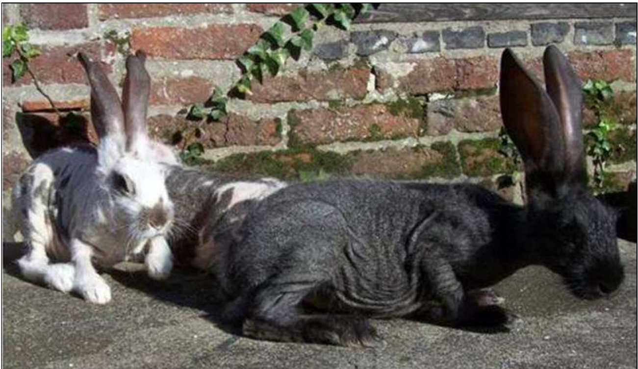
Figure 2: Trois membres d'une même nichée de lapins tachetés souffrant d'alopecie congénitale généralisée aux Pays-Bas.