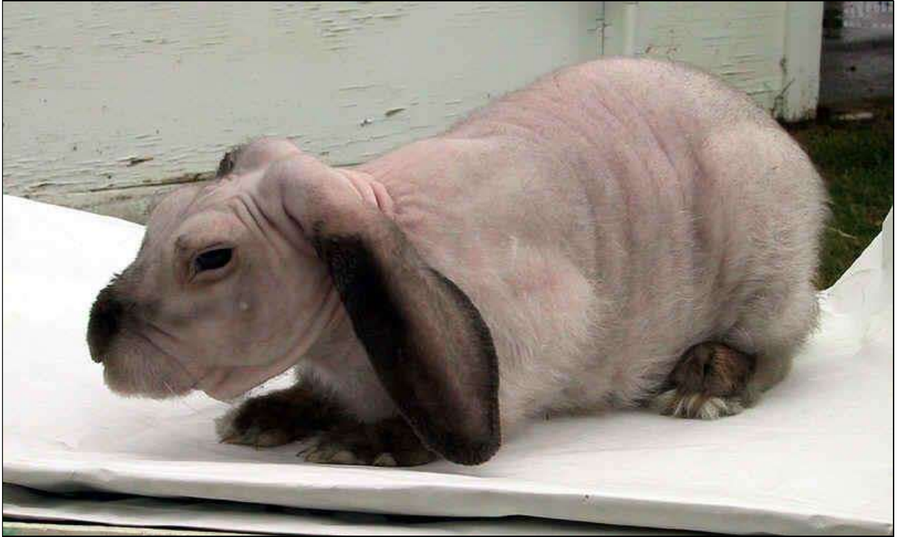
Figure 4: Fuzz, a furless mini lop-eared rabbit, the progenitor of a rare line of furless rabbits.

an almost complete hairlessness. Only a few guard hairs cover the skin, which presents a transformation of the superficial layers. The latter keratinize and become hard. It is the rarest form of congenital hairlessness. Interestingly, these nearly hairless rabbits tolerate summer temperatures well (Figure 3).