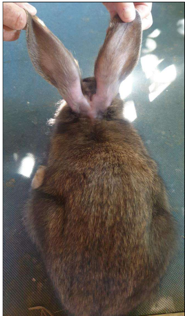
Figure 5: Young Belgian bearded rabbit affected by local hairlessness linked to one type of hair. When younger, it did not have fur on its limbs and tights.